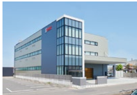
Renovated head office (top) and factory (bottom)