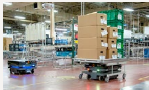
AMR use cases

There is a rising need for solutions that improve productivity by utilizing automation in ways that achieve greater value added—such as automating conveyance processes at factories by using AMRs and automatically linking them with the production systems. IDEC FACTORY SOLUTIONS offers total systems that expand the value added of AMRs. To do this, it visualizes customer needs through simulations performed at the conceptual stage, originally develops customized top modules (conveyors, lifters, etc.), and adds features such as automatic linkage with elevators.