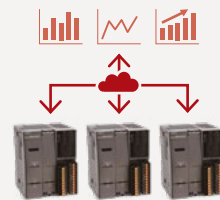
Cloud-based collection and integrated monitoring of data from multiple systems and devices