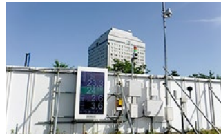
Measurement of environmental conditions at construction site

Safety and efficiency at construction sites are improved by monitoring of local weather data and measurement data (Sokusyou Niigata Co., Ltd.).