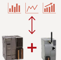
Simple cloud-based collection and monitoring of system and device data