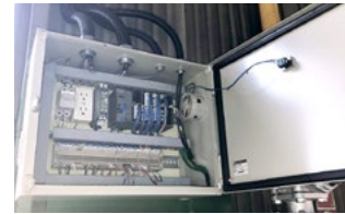
Molten aluminum holding furnace monitoring system

Production line availability and workload are improved by full-time monitoring of molten aluminum holding furnace conditions and monitoring of energy consumption (SHIZUOKA GAS ENGINEERING Co., Ltd.).