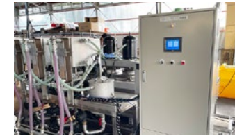
Control of biomass power generation

Maintenance workload is reduced through control of stirring engine used for biomass power generation, and through creation of a remote monitoring system with a simple device configuration (EcoSTAGE Co., Ltd.).