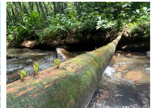
Award-winning photographs in the Environmental Photo Contest held on the theme of "Biodiversity" as one of the events during CSR Month 2022